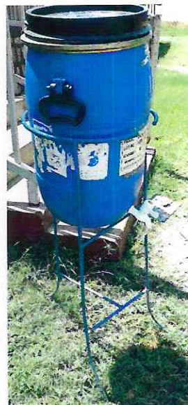
Metallic station (Metallic base of 16 mm \phi )