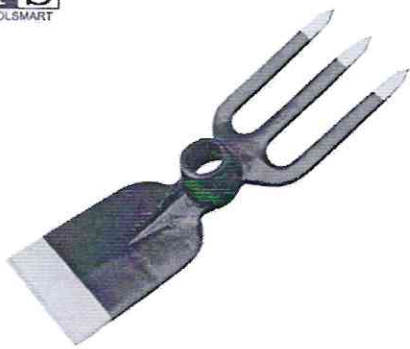
Tines Rail Steel Garden Hoe.