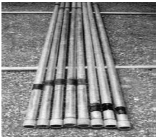
GI Pipes with sockets, 32mm x3 m long, class B, weight 8 Kgs Indian Mark II