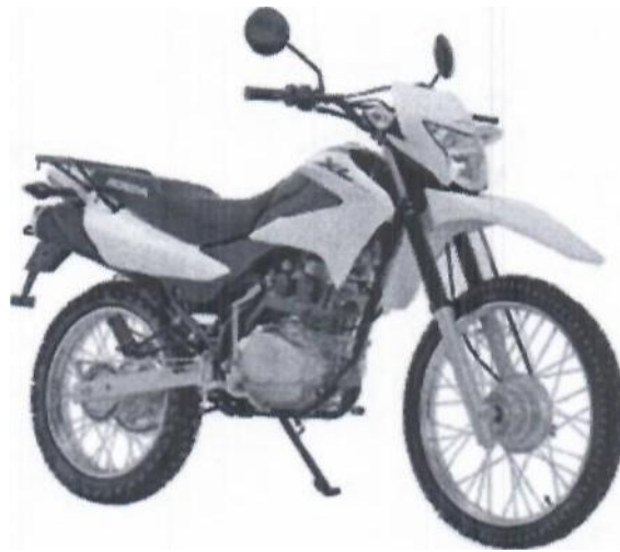
Figure 1. HONDA XL 125 on & OffRoad