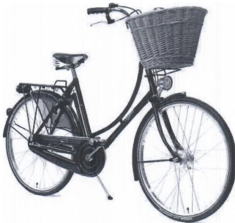
Figure 2 Bicycle Princes Severance Classic