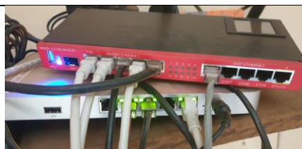
Mikrotik + Meraki