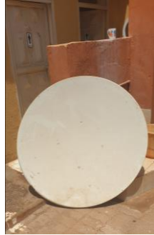
1.3-meter dish in store (not in use)