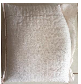
Nylon factory woven bag recommended for packing of cereal seeds