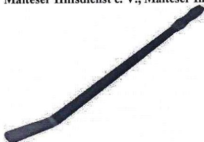
Grass slasher / Plastic black handle.

Malteser Hilfsdienst e. V., Malteser International, Erna-Scheffler-Str. 2, 51103 Cologne, Germany