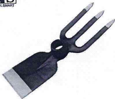
3 Tines Rail Steel Garden Hoe.