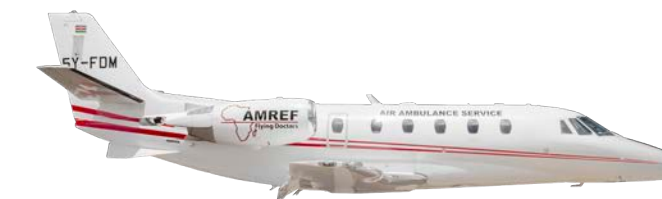
Cessna Citation XLS Jet C560