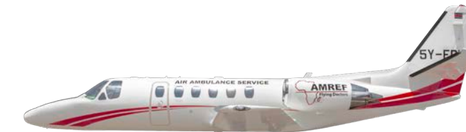
Cessna Citation Bravo Jet C550