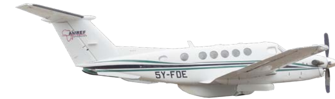
King Air B200