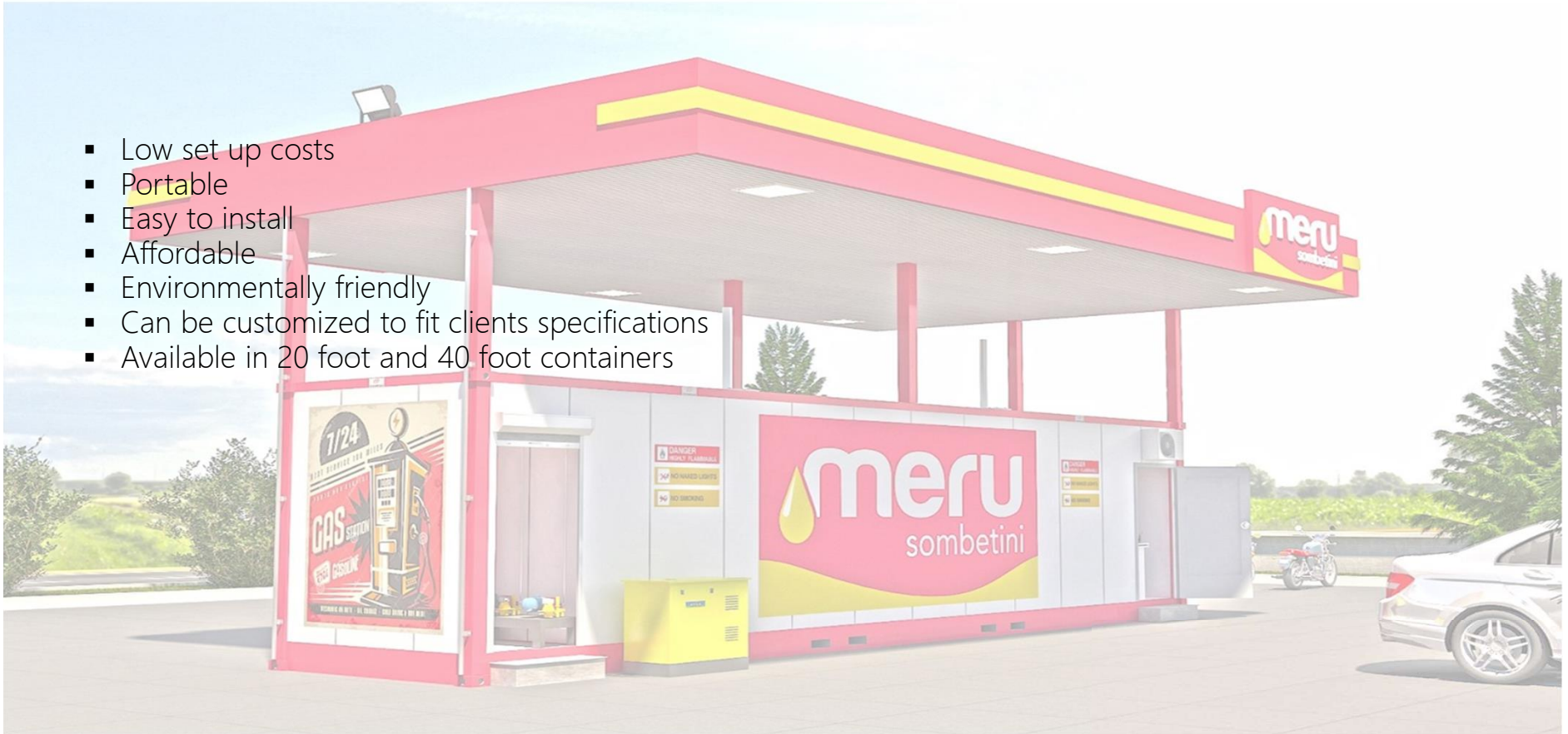
20ft Mobile Petrol Station